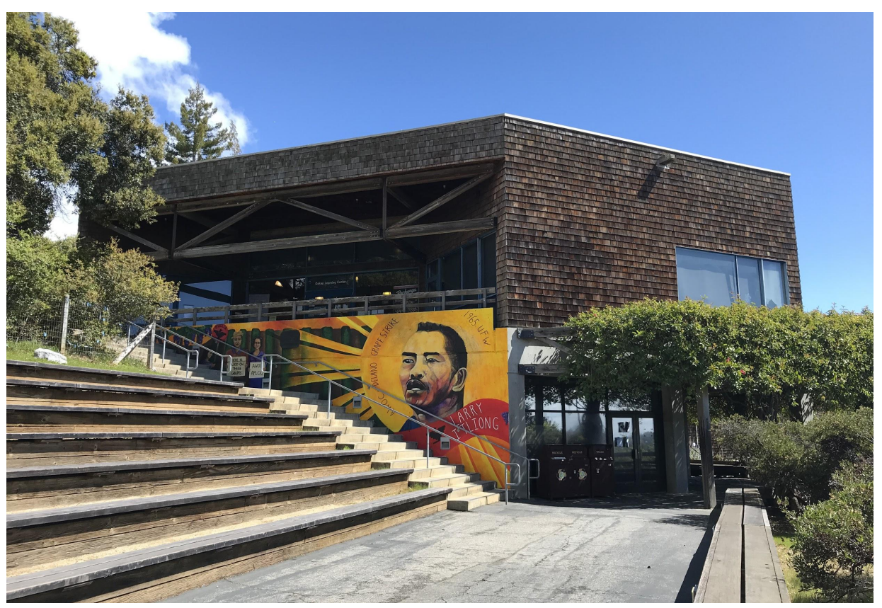
UC Santa Cruz 2020 Long Range Development Plan Historic Resources Technical Memorandum

completed for: ascent environmental, inc. sacramento, ca